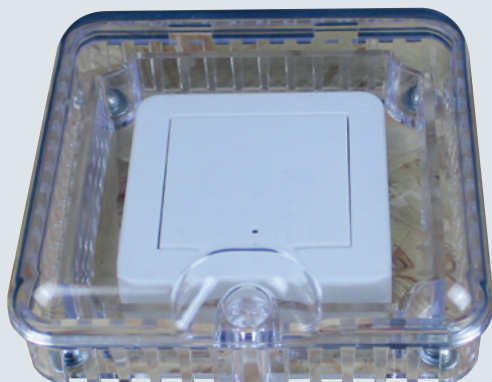
Standard square case